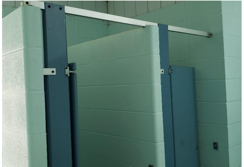
Women's restroom/changing room Lake Side